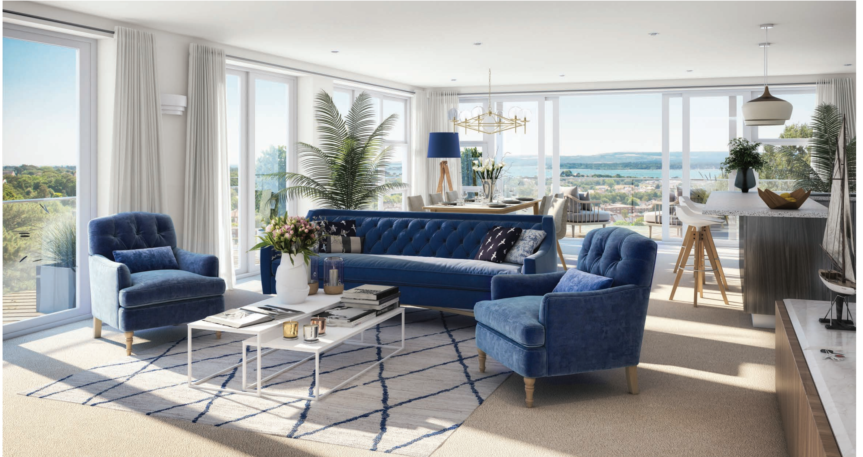
Computer Generated Image - Typical open plan apartment layout.