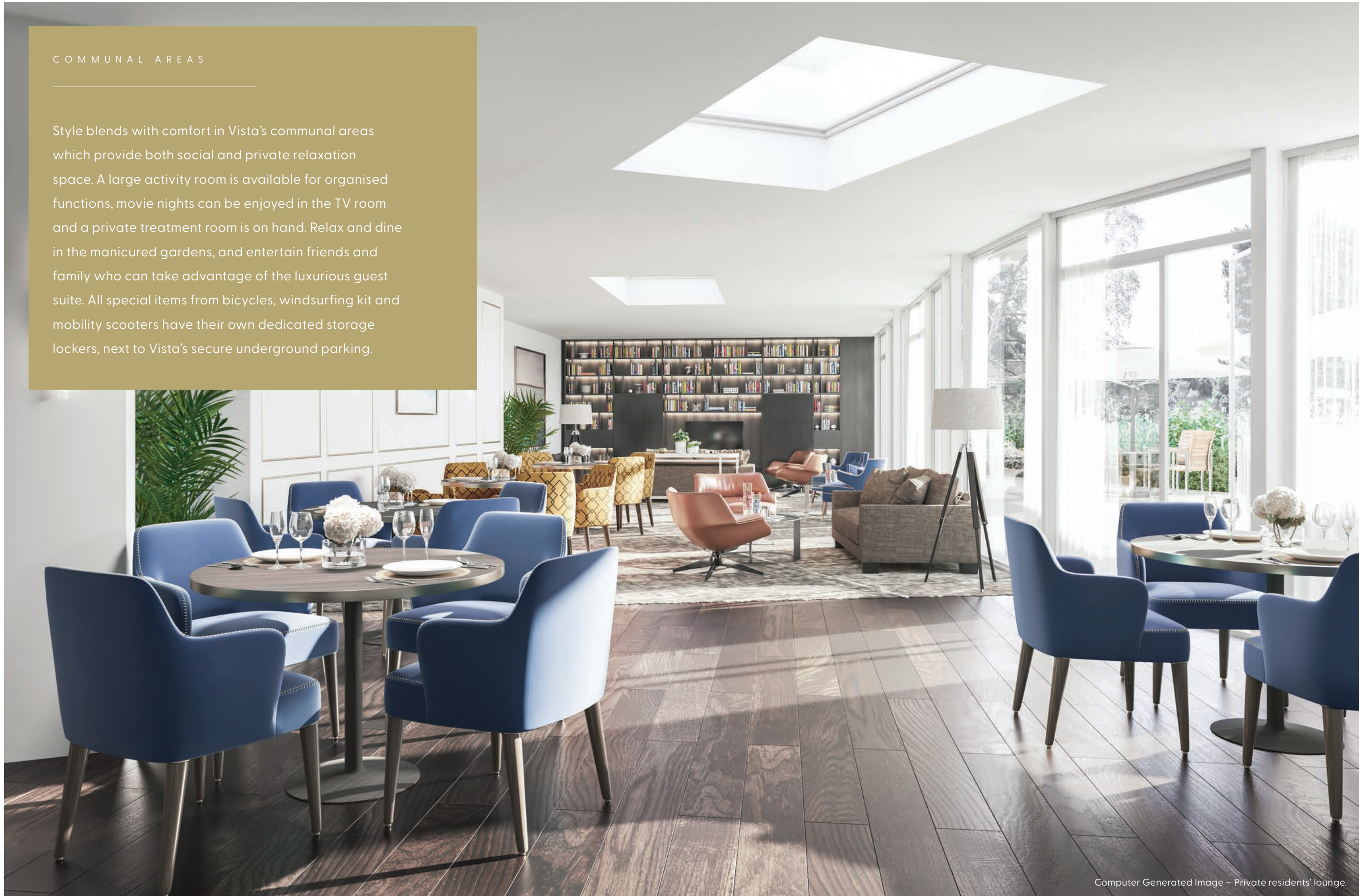
Computer Generated Image – Private residents' lounge.

Style blends with comfort in Vista's communal areas which provide both social and private relaxation space. A large activity room is available for organised functions, movie nights can be enjoyed in the TV room and a private treatment room is on hand. Relax and dine in the manicured gardens, and entertain friends and family who can take advantage of the luxurious guest suite. All special items from bicycles, windsurfing kit and mobility scooters have their own dedicated storage lockers, next to Vista's secure underground parking.