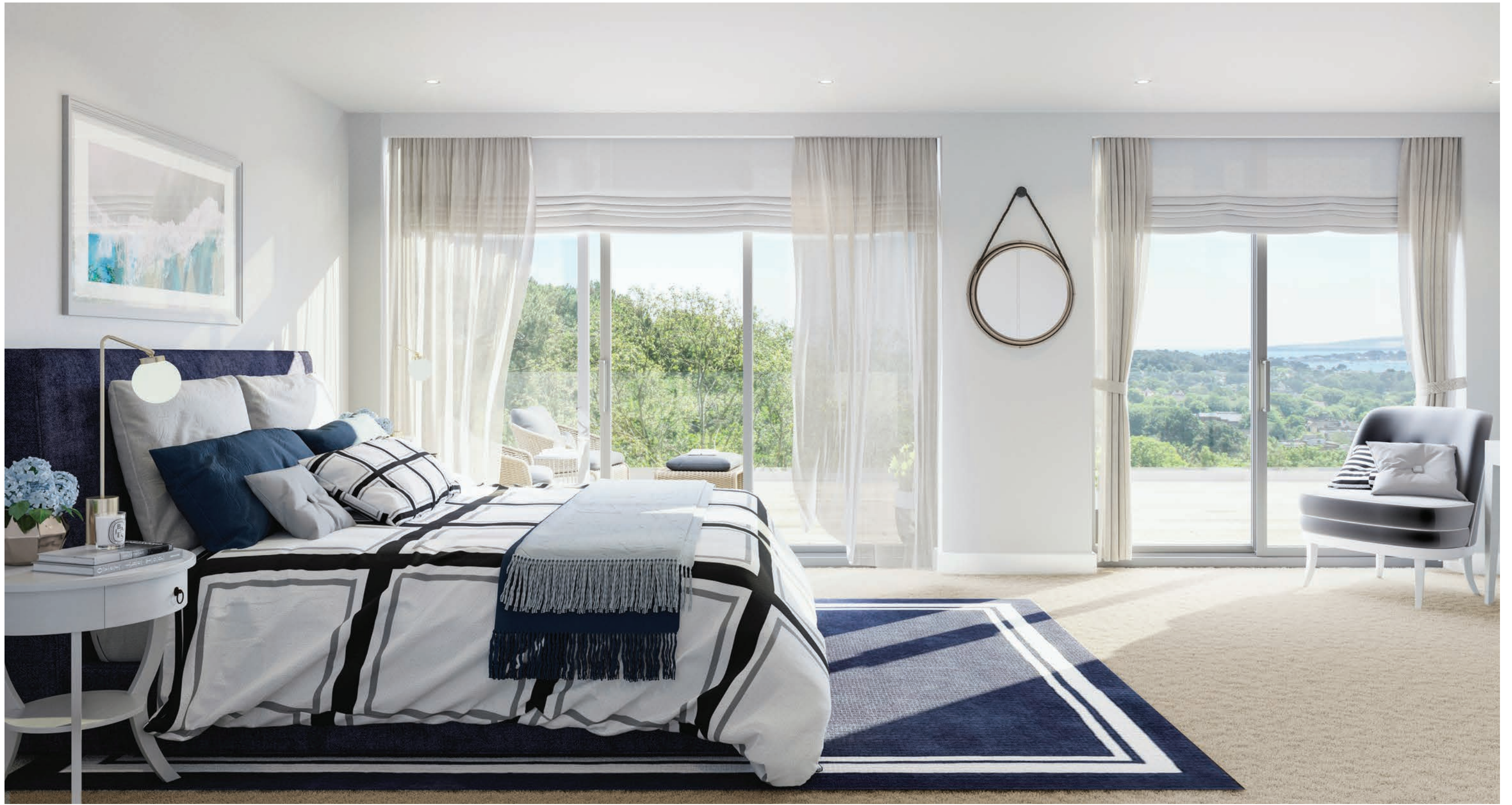
Computer Generated Image - Typical bedroom layout.