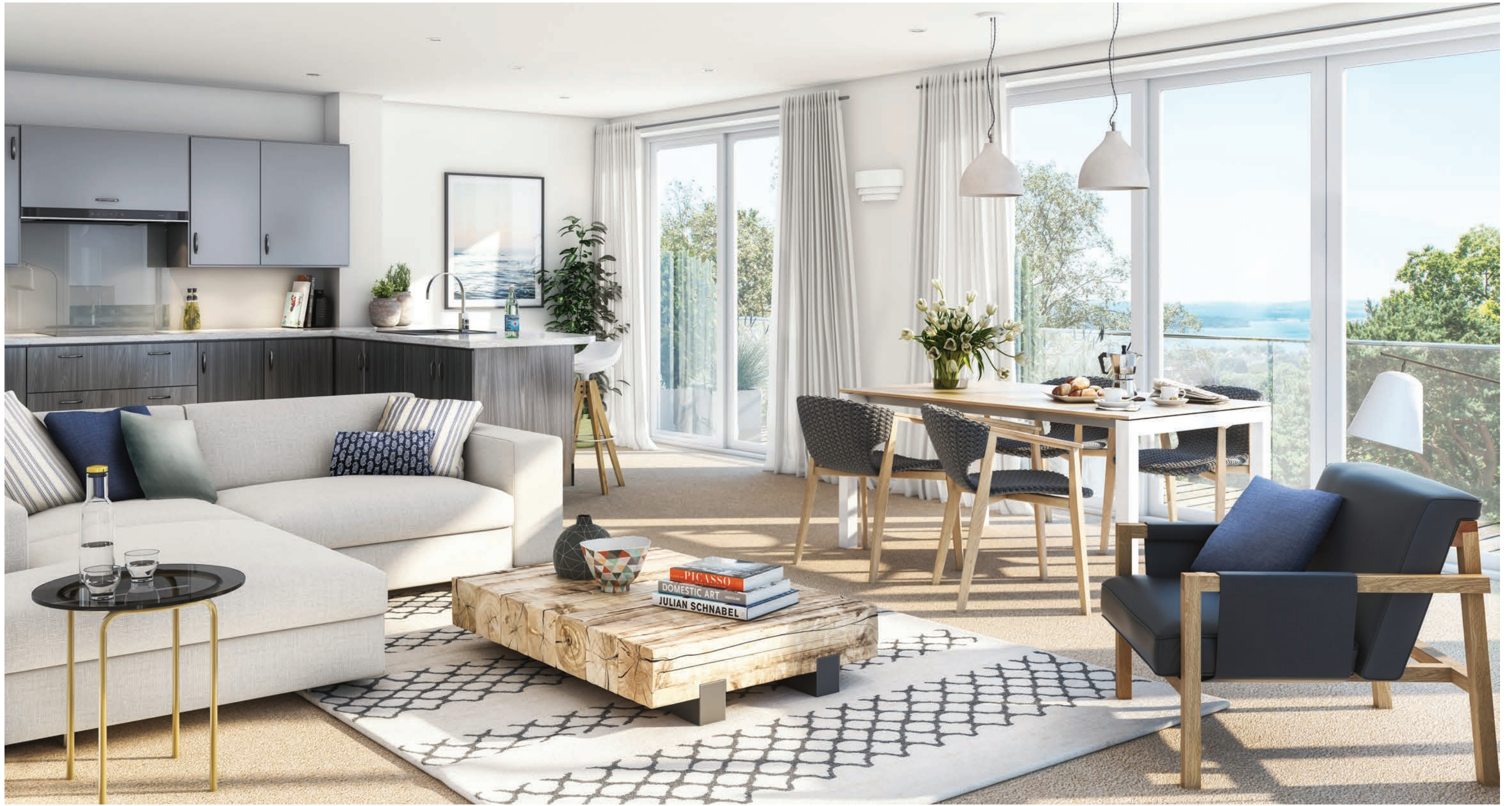
Computer Generated Image - Typical open plan apartment layout.