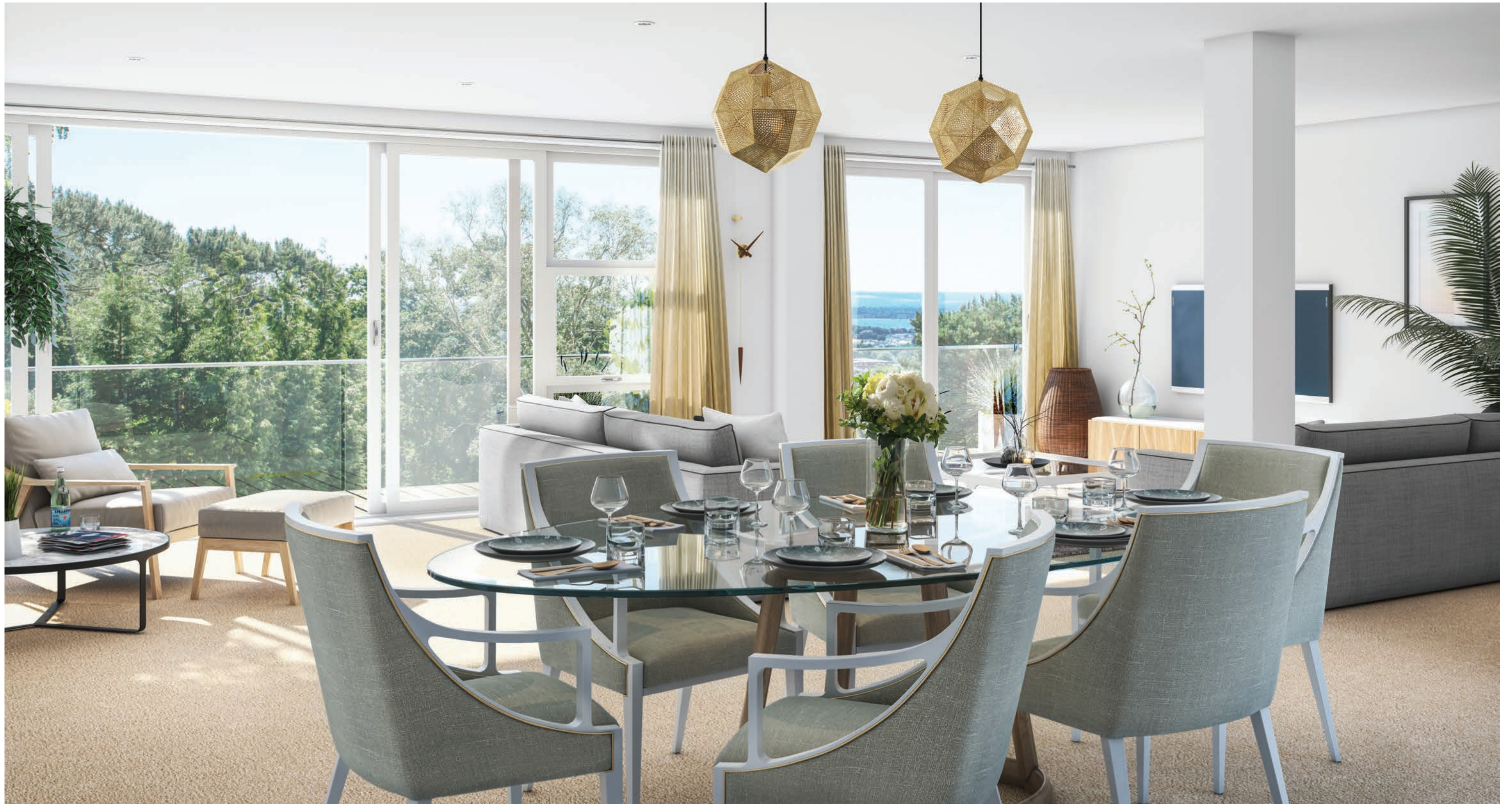
Computer Generated Image - Typical open plan apartment layout.